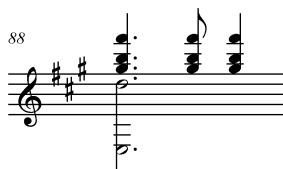
Figure 4. Valsa Concerto , 88.

The introduction is followed by the Valsa itself which, in its unfinished state consists of two principal themes, the first in E-major and the second in A-major, connected via an audacious transition through A flat-major (figure 5):