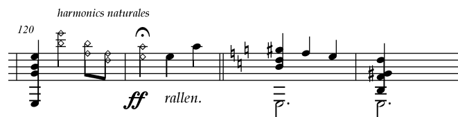
Figure 6. Valsa Concerto , 120-23.

Although incomplete, Villa-Lobos' surviving manuscript presents a work very much in an advanced state of composition (Villa-Lobos' catalogue of works lists the duration of the complete piece at 3 minutes), and provides almost all of the material needed to complete the