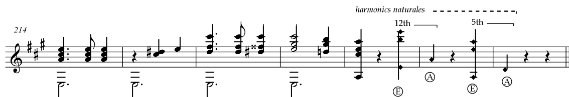
Figure 7. Valsa Concerto , 214-20.

It is remarkable that a three-page manuscript of an incomplete piece of guitar music, written by a seventeen year-old guitarist in Rio de Janeiro almost a century ago, could command our attention today. It is also a testament to the originality and genius of the most important composer to have written a substantial body of music for the guitar—Heitor Villa-Lobos.