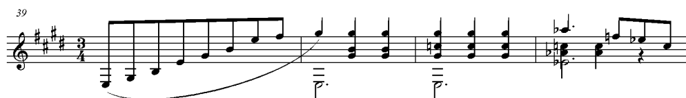
Figure 5. Valsa Concerto , 39-42.

The second theme and the transitions that lead to and from it contain passagework which, at one to a bar, are fully worthy of the description brilhante . Directly following the first statement of this second theme, the manuscript contains eleven empty measures. Most likely, this represents a "placeholder" for a second statement of the theme, a notational shortcut that saves the composer the trouble of writing out what can wait until later. Villa-Lobos prepared a third theme, in A-minor, but after presenting only two measures of it the manuscript comes to an abrupt end (figure 6):