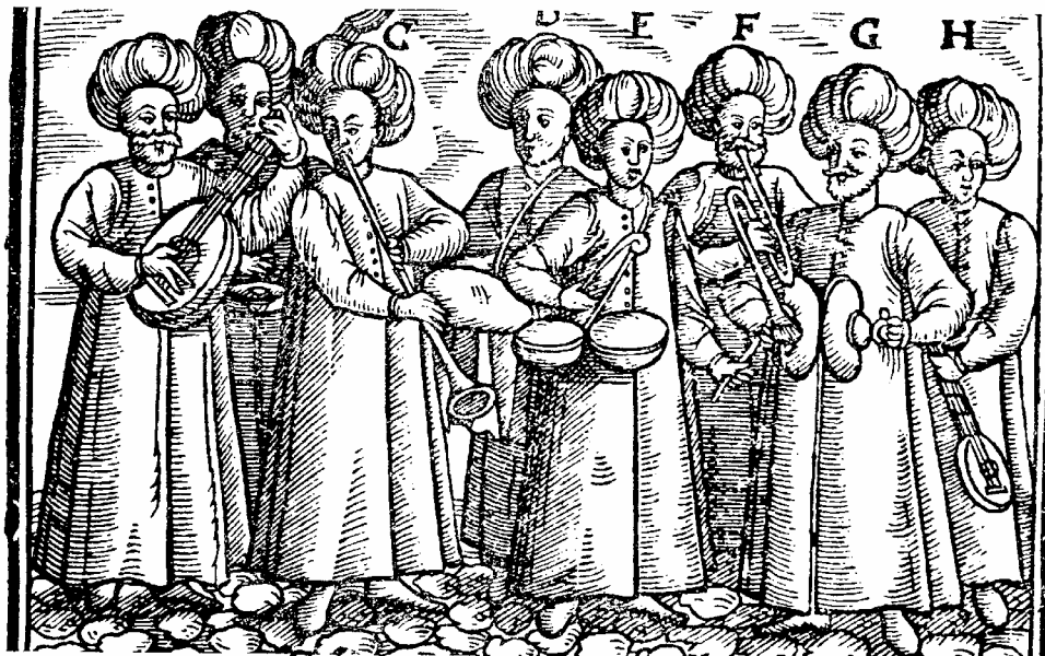
16th-century "Beglerbeg" [a local ruler's] music ensemble from Belgrade mentioned by the Austrian traveller Salomon Schweigger in 1576

In the early seventeenth century the guitar gradually displaced the lute in our country, first as an accompanying instrument, and later as a solo one. During the seventeenth century the guitar was very popular in many Dalmatian towns and villages. In other places, such as certain Serbian cities under Turkish rule, an instrument very much like the Dalmatian guitar was also played. Salomon Schweigger, a deputy of Austria's King Rudolf the Second who travelled through Serbia in 1576, wrote: "I saw young people in the streets playing on instruments that strongly resemble our sithers, and also on some strange-looking instruments that reminded me of big wooden spoons." 2