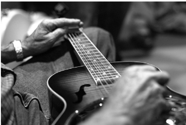
A man playing a Dobro guitar