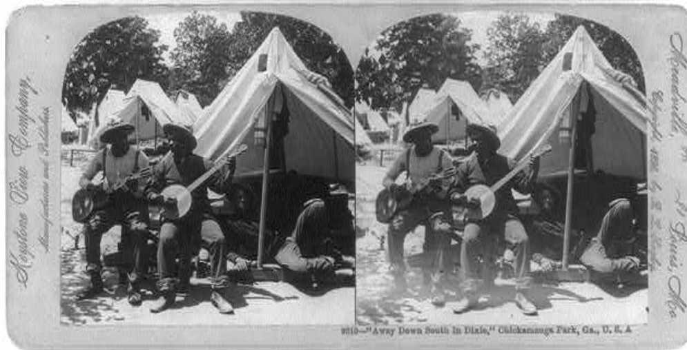
"Away Down South in Dixie," c. 1898, three African-American soldiers playing banjos