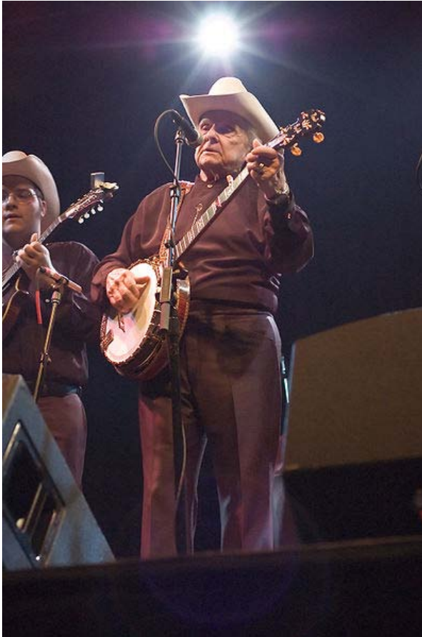
Ralph Stanley performs April 20, 2008.

http://en.wikipedia.org/wiki/File:Ralph_Stanley_2006.jpg