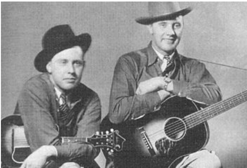
The Monroe Brothers, c. 1936