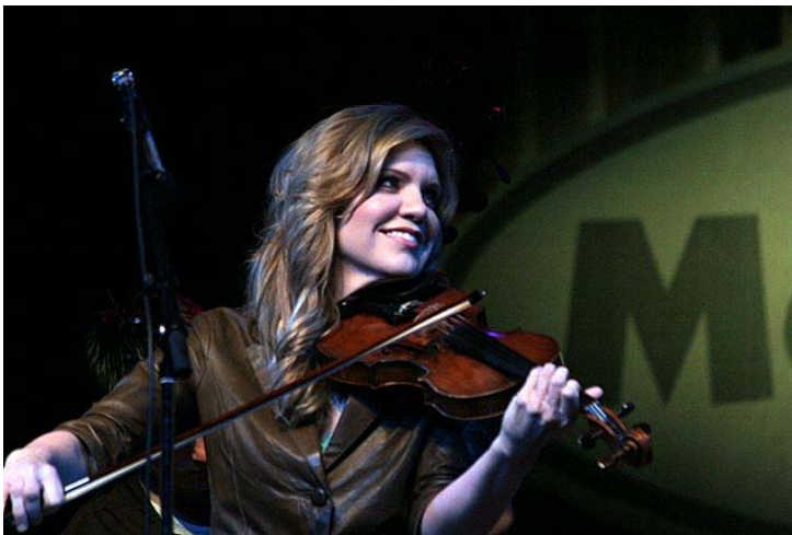
American country/bluegrass musician Alison Krauss performing at MerleFest, Wilkes Community College, Wilkes County, North Carolina.