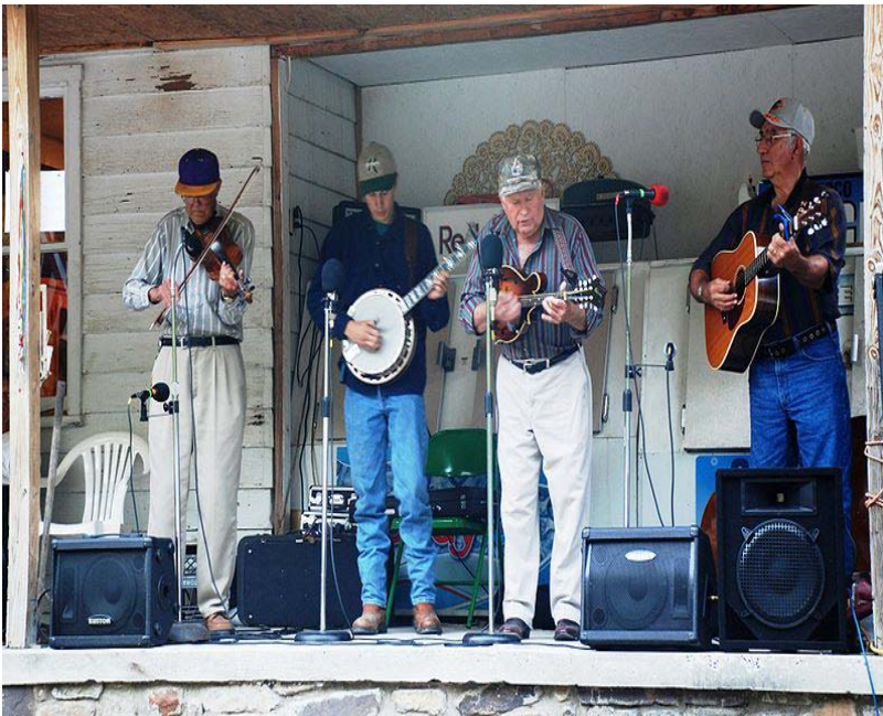
Live Bluegrass music at Shreves Store in Smoke Hole Canyon, West Virginia

http://commons.wikimedia.org/wiki/File:Smoke_Hole_-_Shreves_Store_2.jpg